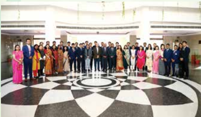
IFS OTs' call on Foreign Secretary, Shri Vinay Mohan Kwatra