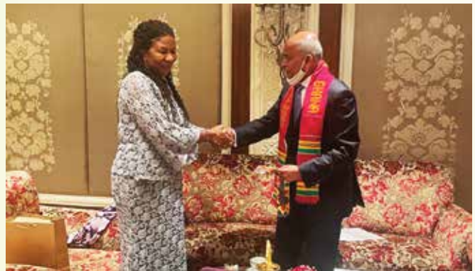
Dean (SSIFS)'s meeting with Acting Coordinating Director, FSI, Ghana