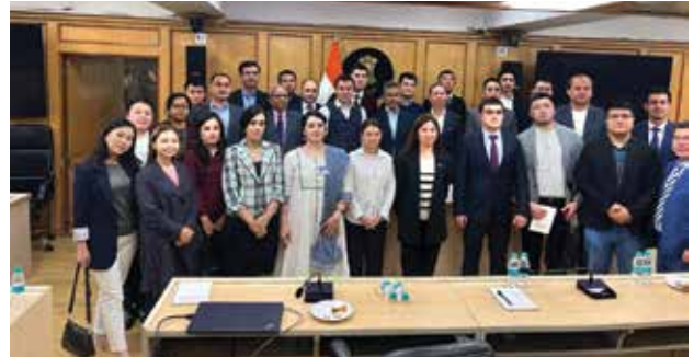
Visit to Election Commission of India