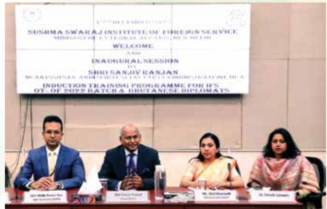
Welcome address by Dean (SSIFS)