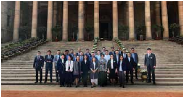
Visit to Rashtrapati Bhavan