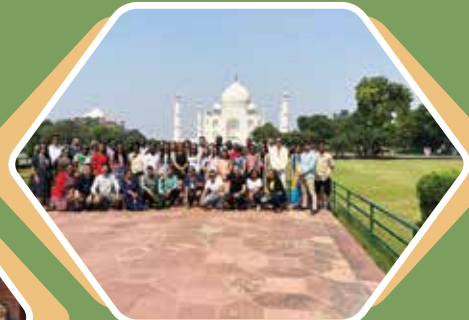
Visit to Taj Mahal, Agra