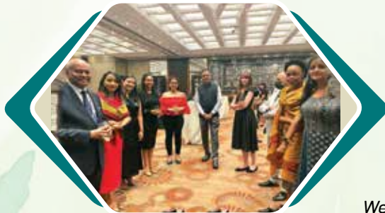
Welcome dinner hosted by Dean (SSIFS)