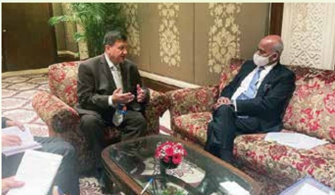
Dean (SSIFS)' meeting with Director, Diplomatic School of Armenia