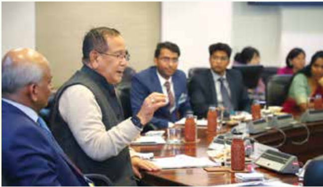
IFS OTs' call on Minister of State for External Affairs & Education, Dr. Rajkumar Ranjan Singh