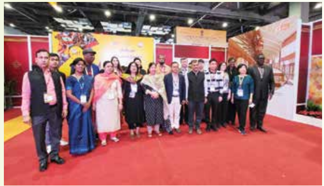
IFDT delegates' visit to the Taj Mahal, Agra, Red Fort and Crafts Museum in Delhi and the India International Trade Fair