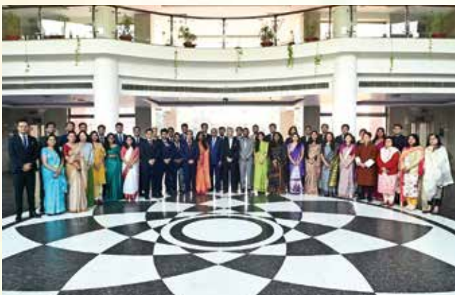
IFS OTs' call on External Affairs Minister, Dr. S. Jaishankar