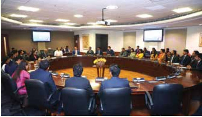
IFS OTs' call on Minister of State for External Affairs & Parliamentary Affairs, Shri V. Muraleedharan