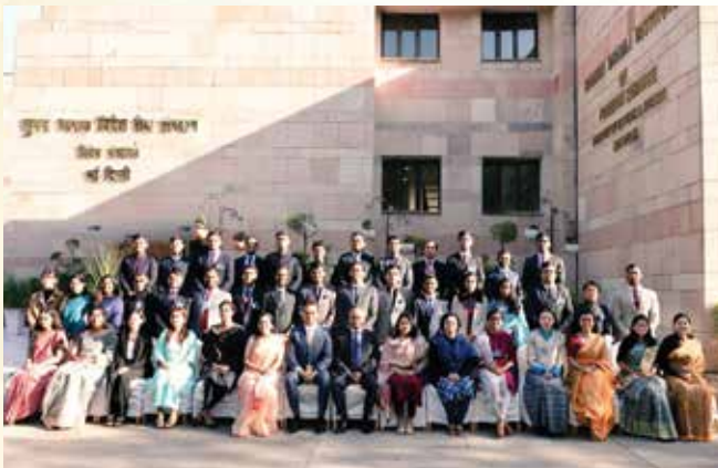
IFS OTs 2022 Batch with Team SSIFS