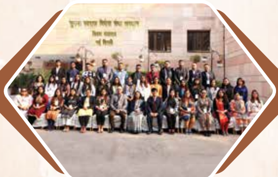
Group photo of 63 rd KIP