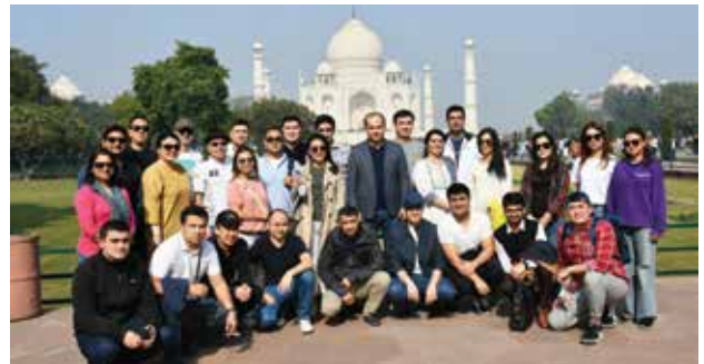
Visit to Taj Mahal, Agra