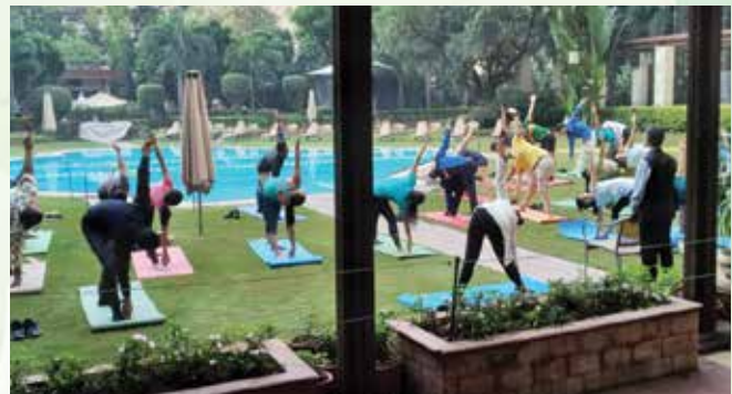
Participants of 69th PCFD participated in the Yoga session