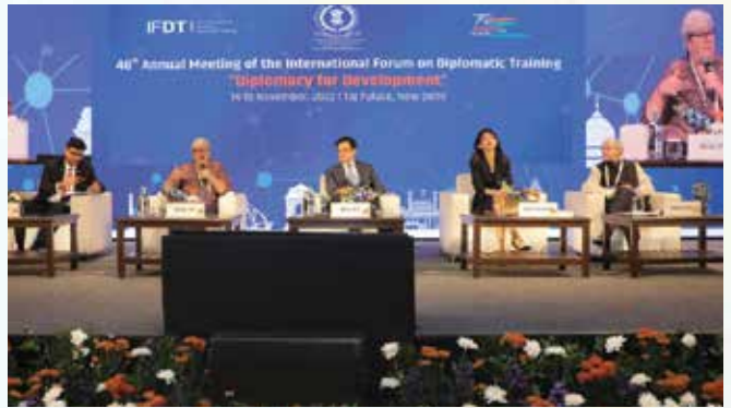
Panel discussions with the participation of eminent scholars and think-tanks