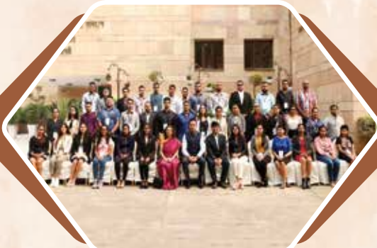
Group photo of 62 nd KIP

a flagship initiative for Diaspora engagement which familiarizes Indian-origin youth (18-30 years) with their Indian roots and contemporary India through a 25-day orientation programme organized by OIA - II Division. The familiarization programme at SSIFS included modules on India and India's foreign policy.