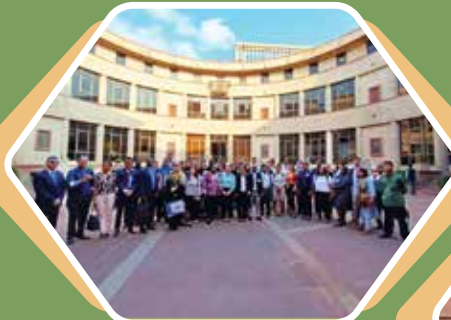
Visit to National Museum