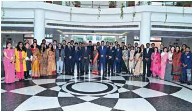
IFS OTs' call on Minister of State for External Affairs & Culture, Smt. Meenakashi Lekhi