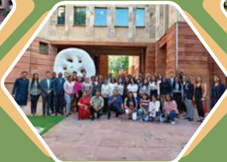
Visit to National Gallery of Modern Art