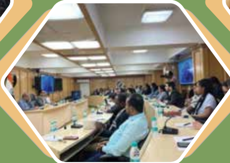
Visit to Election Commission of India