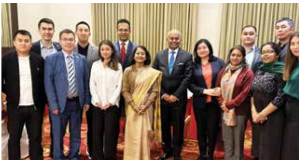
Welcome dinner hosted by Dean (SSIFS)