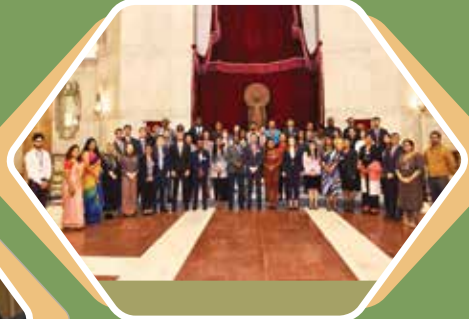
Visit to Rashtrapati Bhavan