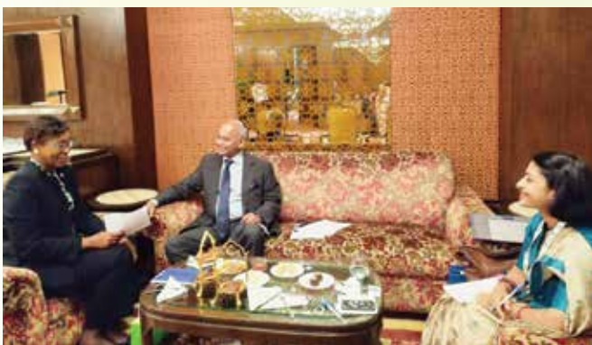
Dean (SSIFS)'s meeting with Permanent Secretary, MFA, Jamaica