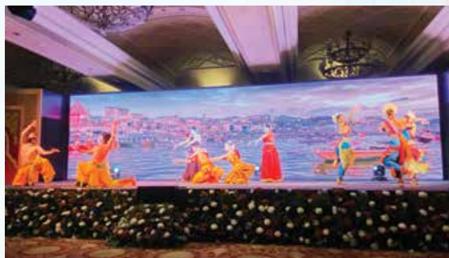
Cultural programme showcasing folk dances of India